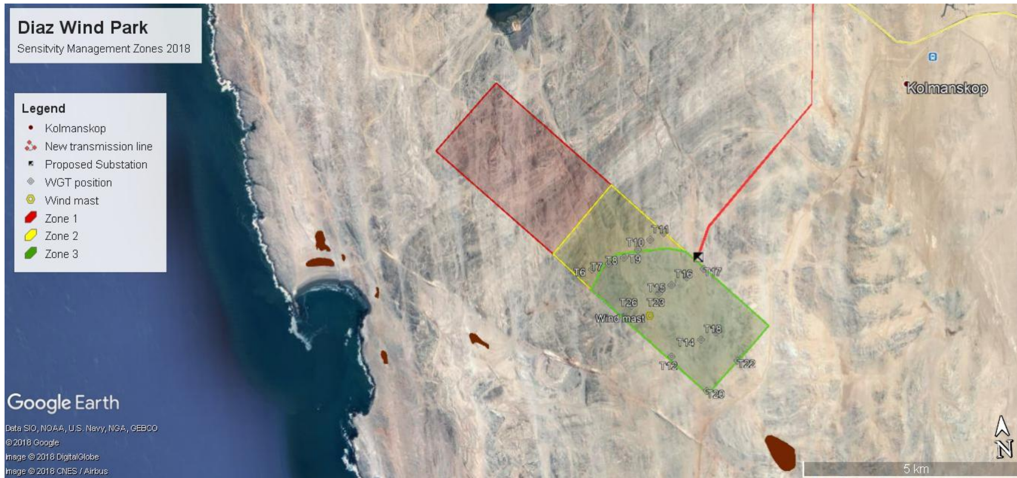
Figure 2: Environmental Management Zones of the Site